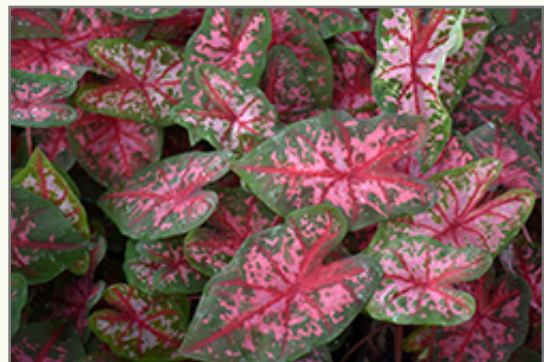
Carolyn Whorton Caladium foliage