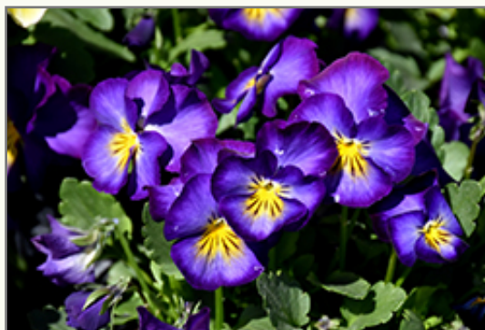
Halo Violet Violet flowers

Halo Violet Violet is an herbaceous perennial with a mounded form. Its relatively fine texture sets it apart from other garden plants with less refined foliage.