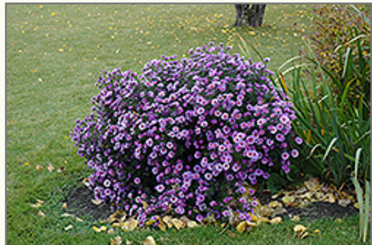
Purple Dome Aster in bloom