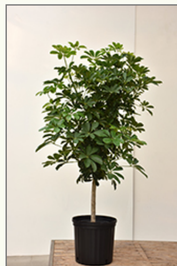
Dwarf Umbrella Tree

This is a multi-stemmed evergreen houseplant with a more or less rounded form. This plant can be pruned at any time to keep it looking its best.