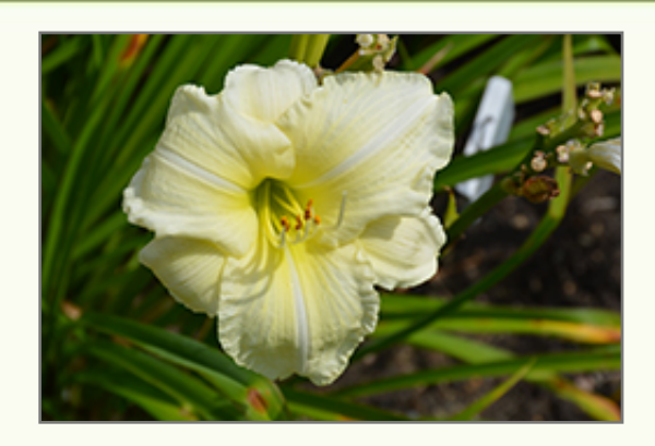
Joan Senior Daylily flowers

Plant Height: 18 inches Flower Height: 32 inches Spread: 24 inches Spacing: 18 inches Sunlight: O O Hardiness Zone: 3a