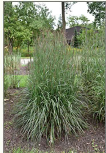
Blackhawks Bluestem in bloom