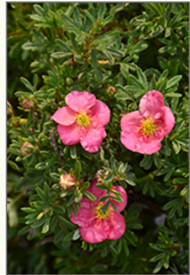
Bella Bellissima Potentilla flowers