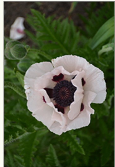
Royal Wedding Oriental Poppy flowers

Royal Wedding Oriental Poppy is recommended for the following landscape applications;