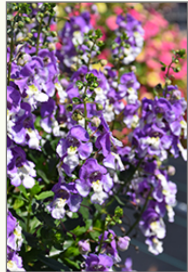
Alonia Big Bicolor Purple Angelonia flowers

Alonia Big Bicolor Purple Angelonia is an herbaceous annual with an upright spreading habit of growth. Its relatively fine texture sets it apart from other garden plants with less refined foliage.