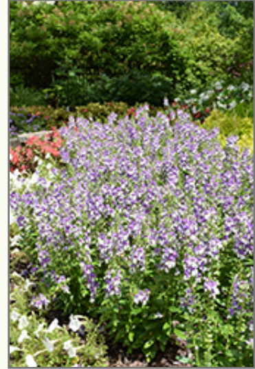
Alonia Big Bicolor Purple Angelonia in bloom