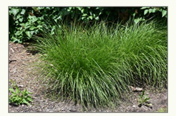
Fox Sedge