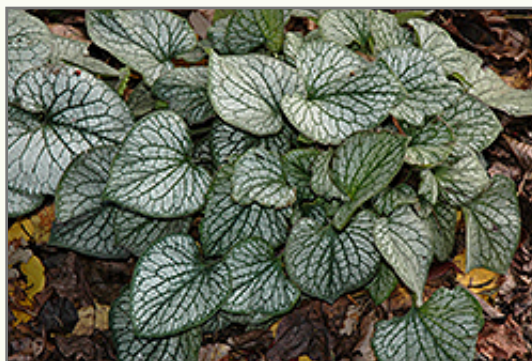
Jack Frost False Forget-Me-Not foliage

Jack Frost False Forget-Me-Not is recommended for the following landscape applications;