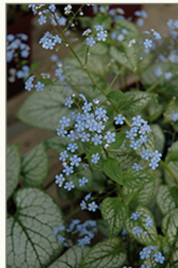
Jack Frost False Forget-Me-Not flowers