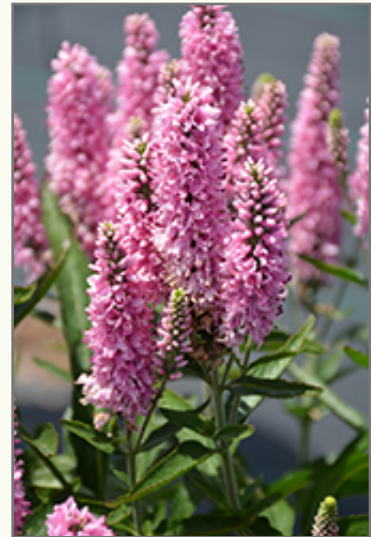
Skyward Pink Long-leaf Speedwell flowers