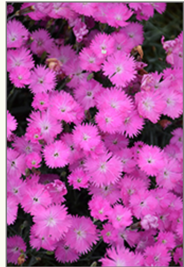
Firewitch Dianthus flowers

Firewitch Dianthus is recommended for the following landscape applications;