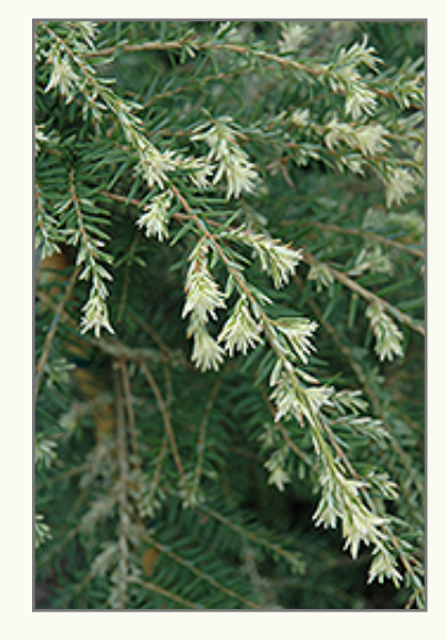
Summer Snow Canadian Hemlock foliage