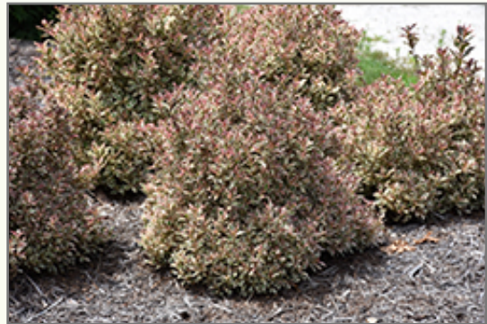
My Monet® Weigela