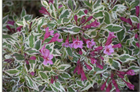
My Monet® Weigela flowers

My Monet® Weigela is recommended for the following landscape applications;