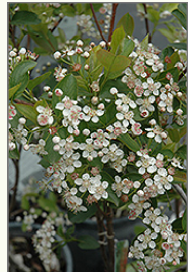
Viking Black Chokeberry flowers