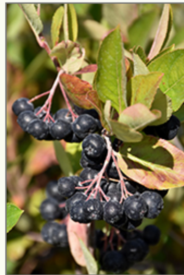
Viking Black Chokeberry fruit