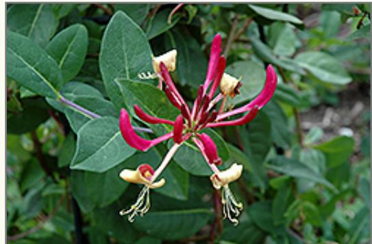
Peaches & Cream Honeysuckle flowers

This woody vine will require occasional maintenance and upkeep, and is best pruned in late winter once the threat of extreme cold has passed. It is a good choice for attracting bees, butterflies and hummingbirds to your yard. It has no significant negative characteristics.