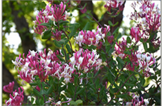
Peaches & Cream Honeysuckle flowers

Peaches & Cream Honeysuckle will grow to be about 20 feet tall at maturity, with a spread of 24 inches. As a climbing vine, it tends to be leggy near the base and should be underplanted with low-growing facer plants. It should be planted near a fence, trellis or other landscape structure where it can be trained to grow upwards on it, or allowed to trail off a retaining wall or slope. It grows at a medium rate, and under ideal conditions can be expected to live for approximately 20 years.