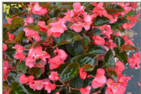
Big Rose Bronze Leaf Begonia flowers