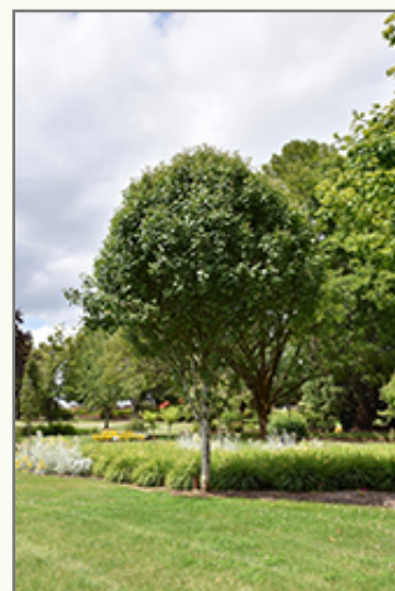
Jack® Flowering Pear