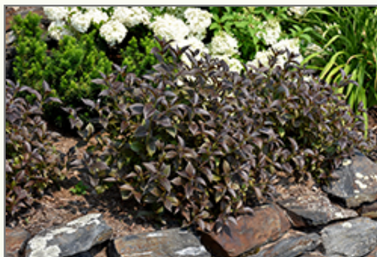
Tango Weigela

Tango Weigela will grow to be about 24 inches tall at maturity, with a spread of 3 feet. It tends to fill out right to the ground and therefore doesn't necessarily require facer plants in front. It grows at a medium rate, and under ideal conditions can be expected to live for approximately 30 years.