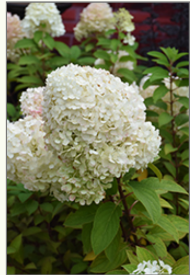
Bobo® Hydrangea flowers