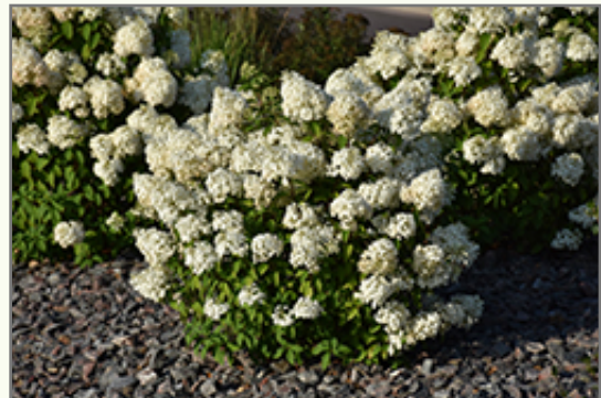
Bobo® Hydrangea in bloom