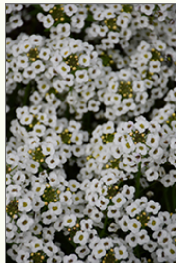
Stream White Sweet Alyssum flowers

This plant will require occasional maintenance and upkeep, and should not require much pruning, except when necessary, such as to remove dieback. It is a good choice for attracting bees and butterflies to your yard, but is not particularly attractive to deer who tend to leave it alone in favor of tastier treats. It has no significant negative characteristics.