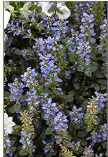
Chocolate Chip Ajuga flowers

Chocolate Chip Ajuga is recommended for the following landscape applications;