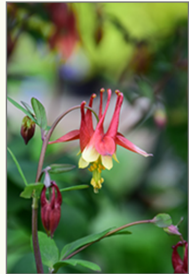
Columbine flowers