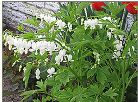
Old Fashioned White Bleeding Heart in bloom

Old Fashioned White Bleeding Heart will grow to be about 30 inches tall at maturity, with a spread of 30 inches. When grown in masses or used as a bedding plant, individual plants should be spaced approximately 30 inches apart. It grows at a medium rate, and under ideal conditions can be expected to live for approximately 15 years. As an herbaceous perennial, this plant will usually die back to the crown each winter, and will regrow from the base each spring. Be careful not to disturb the crown in late winter when it may not be readily seen! As this plant tends to go dormant in summer, it is best interplanted with late-season bloomers to hide the dying foliage.