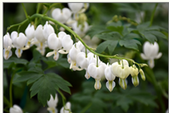
Old Fashioned White Bleeding Heart flowers