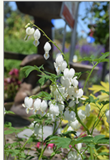
Old Fashioned White Bleeding Heart flowers

Old Fashioned White Bleeding Heart is recommended for the following landscape applications;