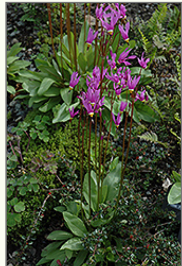
Shooting Star in bloom