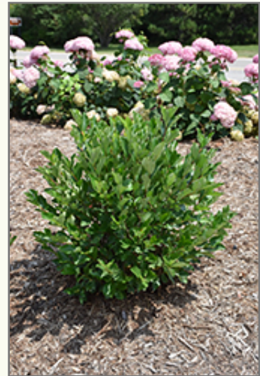
Low Scape® Hedger Black Chokeberry

Low Scape® Hedger Black Chokeberry is a multi-stemmed deciduous shrub with an upright spreading habit of growth. Its average texture blends into the landscape, but can be balanced by one or two finer or coarser trees or shrubs for an effective composition.