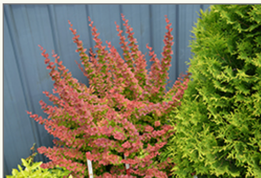
Sunjoy® Tangelo Barberry