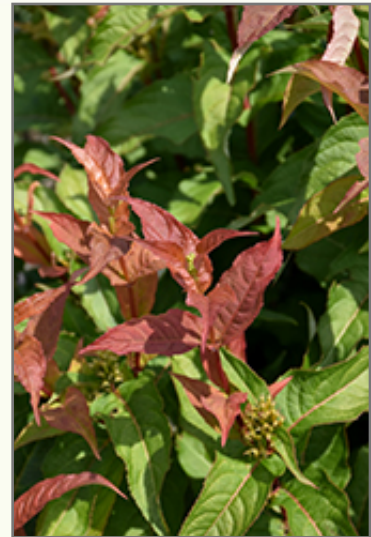
Kodiak® Orange Bush Honeysuckle foliage