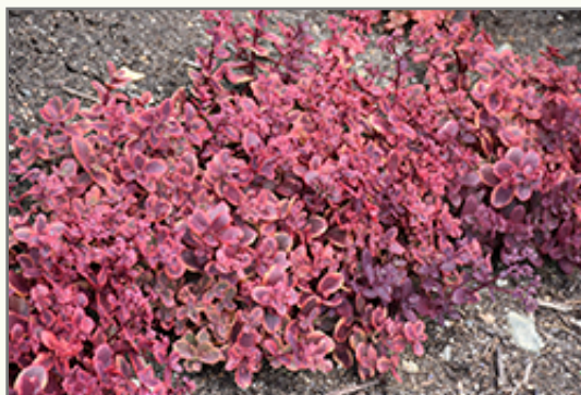
SunSparkler® Wildfire Sedum