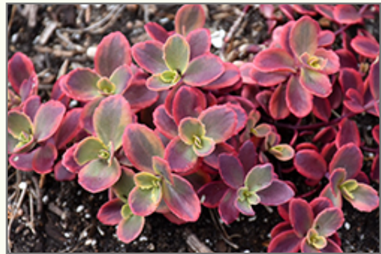
SunSparkler® Wildfire Sedum foliage