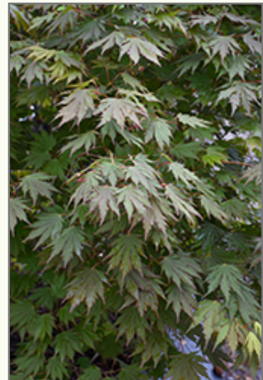
Northern Glow® Maple foliage