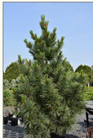
Westerstede Swiss Stone Pine

Westerstede Swiss Stone Pine is recommended for the following landscape applications;