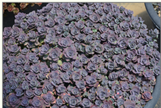
SunSparkler® Blue Elf Sedum