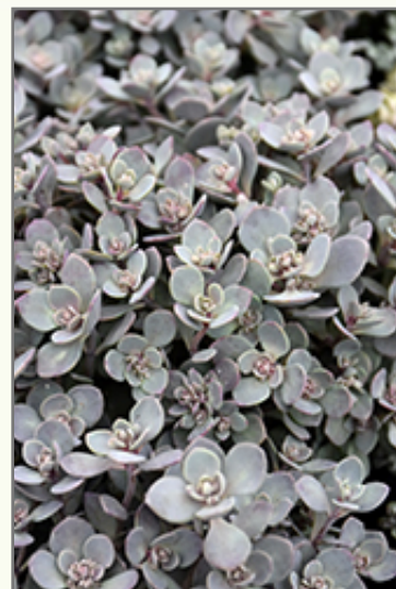
SunSparkler® Blue Elf Sedum foliage