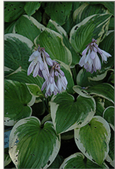
Golden Tiara Hosta flowers