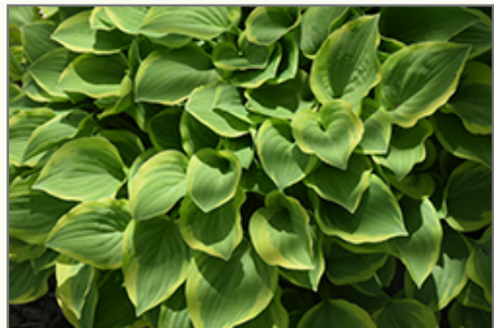
Golden Tiara Hosta foliage