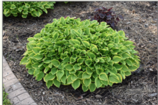
Golden Tiara Hosta