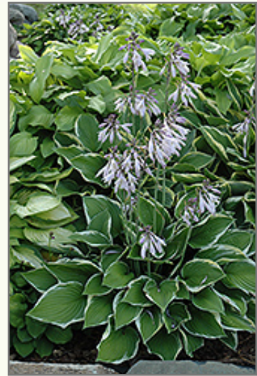
Montana Aureomarginata Hosta in bloom