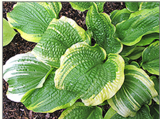
Montana Aureomarginata Hosta foliage