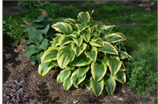
Montana Aureomarginata Hosta