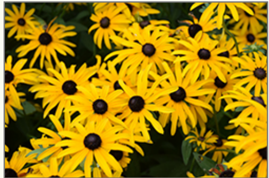
Deamii Black Eyed Susan flowers

Deamii Black Eyed Susan is an herbaceous perennial with an upright spreading habit of growth. Its medium texture blends into the garden, but can always be balanced by a couple of finer or coarser plants for an effective composition.