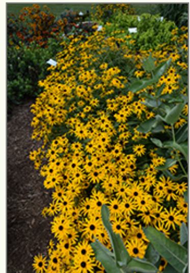
Deamii Black Eyed Susan in bloom