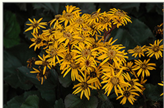
Britt-Marie Crawford Ligularia flowers