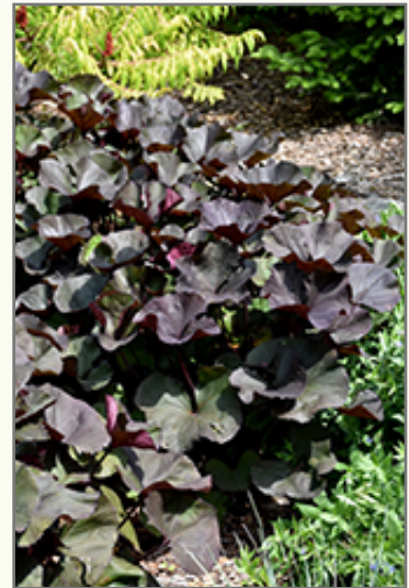
Britt-Marie Crawford Ligularia foliage