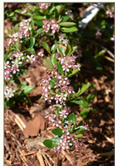
Ground Hog Black Chokeberry flowers