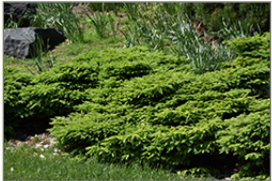
Little Gem Norway Spruce