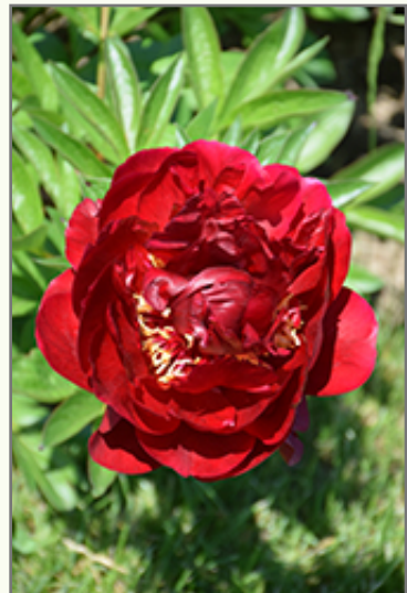
Buckeye Belle Peony flowers