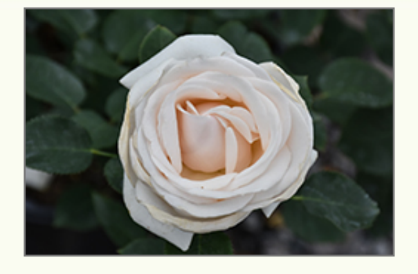
Easy Spirit Floribunda Rose flowers

Easy Spirit Floribunda Rose is a multi-stemmed deciduous shrub with an upright spreading habit of growth. Its average texture blends into the landscape, but can be balanced by one or two finer or coarser trees or shrubs for an effective composition.