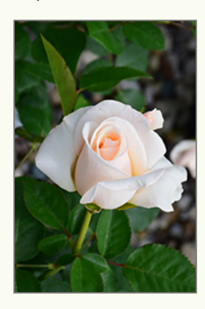
Easy Spirit Floribunda Rose flowers

This shrub will require occasional maintenance and upkeep, and is best pruned in late winter once the threat of extreme cold has passed. It is a good choice for attracting bees to your yard. Gardeners should be aware of the following characteristic(s) that may warrant special consideration;