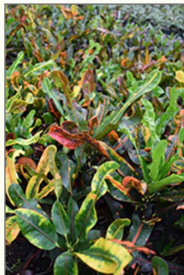
Mammy Croton in full

This is a dense herbaceous evergreen houseplant with an upright spreading habit of growth. Its wonderfully bold, coarse texture is quite ornamental and should be used to full effect. This plant should not require much pruning, except when necessary to keep it looking its best.