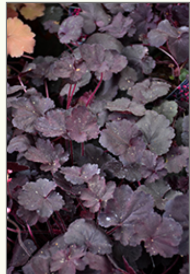
Black Forest Cake Coral Bells foliage