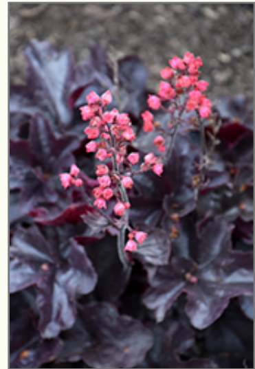
Black Forest Cake Coral Bells flowers

This is a relatively low maintenance plant, and should be cut back in late fall in preparation for winter. It is a good choice for attracting hummingbirds to your yard. It has no significant negative characteristics.