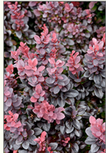
Concord Barberry foliage