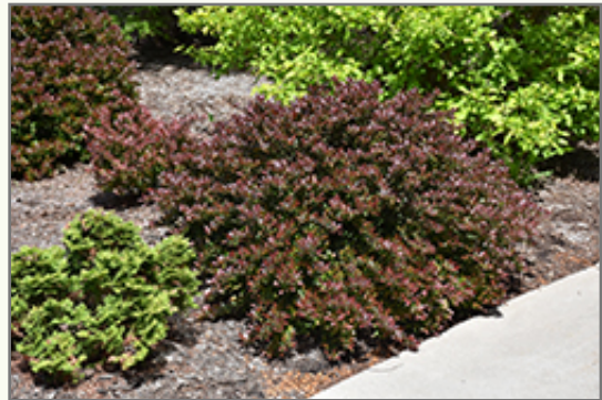
Concord Barberry

This is a relatively low maintenance shrub, and can be pruned at anytime. Deer don't particularly care for this plant and will usually leave it alone in favor of tastier treats. Gardeners should be aware of the following characteristic(s) that may warrant special consideration;