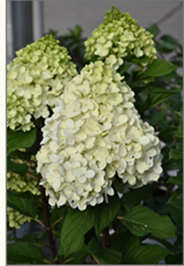
Little Lime Punch Hydrangea flowers

Little Lime Punch Hydrangea is recommended for the following landscape applications;