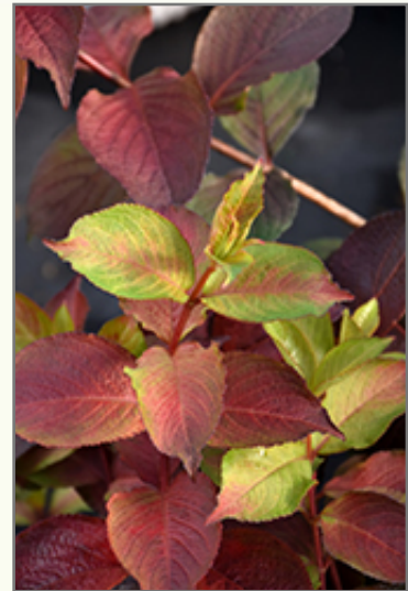
Midnight Sun Reblooming Weigela foliage