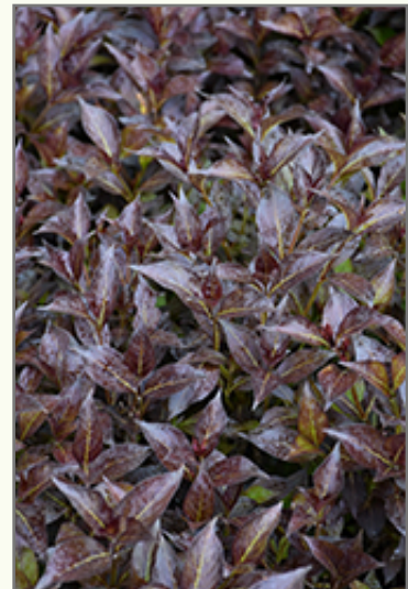
Midnight Wine Shine Weigela foliage