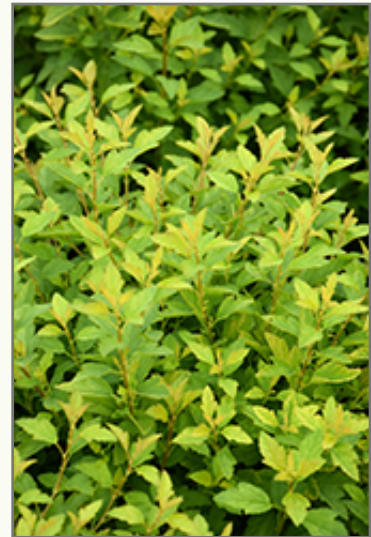
Raspberry Lemonade Ninebark foliage

This shrub will require occasional maintenance and upkeep, and can be pruned at anytime. It has no significant negative characteristics.