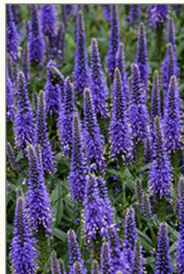
Skyward Blue Long-leaf Speedwell flowers

Skyward Blue Long-leaf Speedwell is recommended for the following landscape applications;