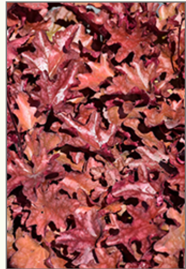
Peach Flambe Coral Bells foliage

This is a relatively low maintenance plant, and should be cut back in late fall in preparation for winter. It is a good choice for attracting hummingbirds to your yard. It has no significant negative characteristics.